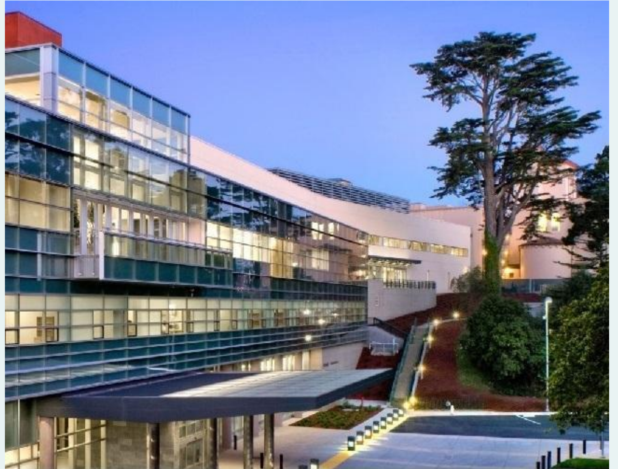
LAGUNA HONDA HOSPITAL AND REHABILITATION CENTER

LAGUNA HONDA HOSPITAL AND REHABILITATION CENTER SAN FRANCISCO DEPARTMENT OF PUBLIC HEALTH