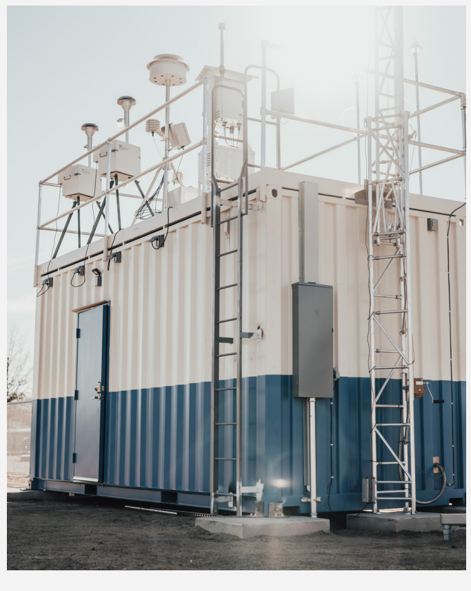
NNPH's Air Monitoring Station, one of seven managed by the Air Quality Management Division